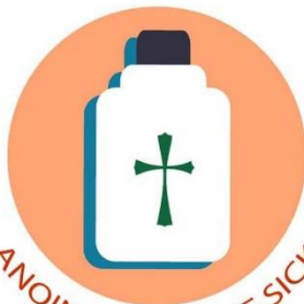
ANOINTING OF THE SICK